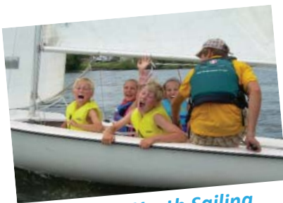
Support Youth Sailing